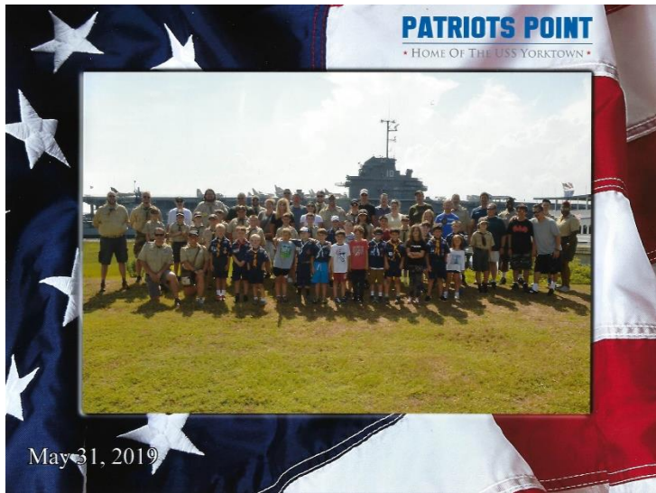
Cub Scout Pack 625 camped aboard the Aircraft Carrier USS Yorktown at Patriots Point in May.