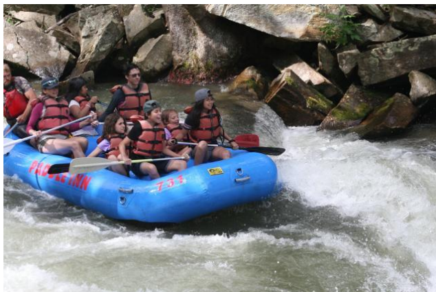
Troop 1208, Nantahala River