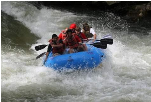
Troop 625, Nantahala River

I know what you're thinking. Is that ALL ? Is that the best they have ? Quite frankly — no, and I'm glad you asked. The Scouts will be working with the Men's Group and some special local projects very soon. Yeah, I saw you flinch Mr. Dishwasher. No, we're not telling yet, so you'll have to wait. Without further delay, these are your Scouts in Action!