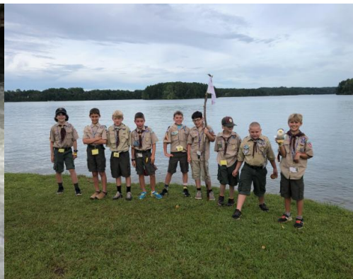
Pack 625, Scoutland summer camp. Yes, that is the Aflac Duck.