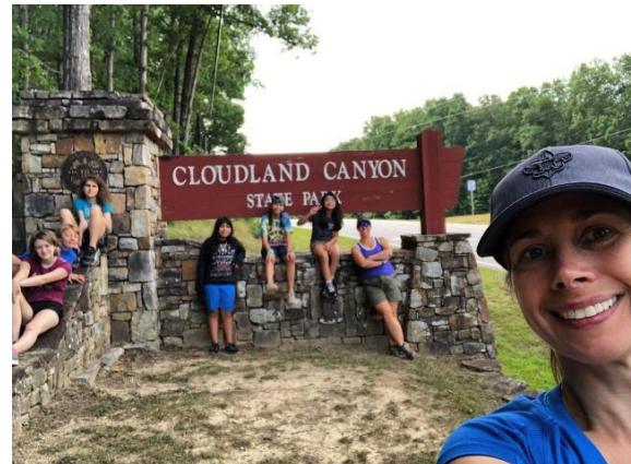
Troop 1208, Cloudland Canyon